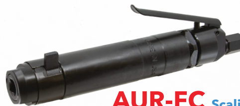
AUR-FC Scaling Hammer

The AUR-FC and AUR-NS are great general purpose scalers and needle scalers. Economic, powerful tool widely used in a variety of industries for scaling, cleaning as well as surface preparation. Chisels are held firmly in place and cannot rotate. Chisels easily changed with a quick release retainer.