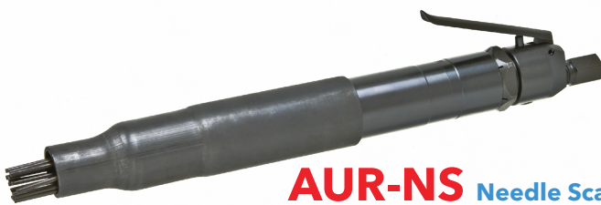
AUR-NS Needle Scaler