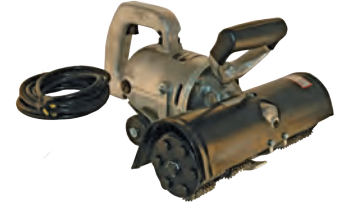
MODEL M5-1E 115v M5-2E 230v

Cleaning area: 8" wide, 1/4 HP AC or DC universal motor. Weight: 11 lbs. Additional cutter bundles #674-E: (set of 4)