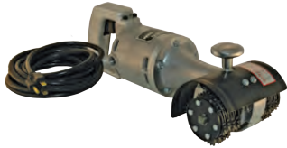
MODEL K7-1 115v K7-2 230v

Cleaning area: 5" wide, 1/4 HP AC or DC universal motor. Weight: 9 lbs. Additional cutter bundles #674: (set of 2)