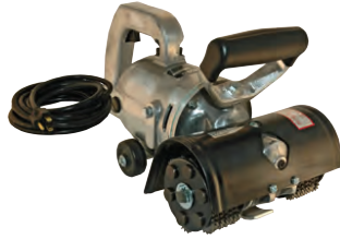
MODEL M5-1 115v M5-2 230v

Cleaning area: 5" wide, 1/4 HP AC or DC universal motor. Weight: 9 lbs. Additional cutter bundles #674: (set of 2)