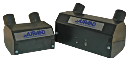
Vacuum dust collection