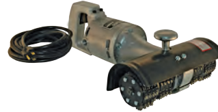
MODEL K7-1E 115v K7-2E 230v

Cleaning area: 8" wide, 1/2 HP AC or DC universal motor. Weight: 23 lbs. Additional cutter bundles #90M: (set of 2)